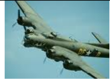
B-17 Flying Fortress

One of the largest aircraft used in WWII, the B-17 was primarily employed in the daylight precision bombing of German targets. It flew in the Pacific as well but on a limited basis against Japanese shipping and airfields.